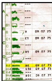
Old style licence

However, something that has apparently caught out many long-term licence holders has been where a replacement licence has been issued if the original licence was lost or destroyed. Your new licence will not include the B+E element (see below). Those who have altered their licence due to name or address changes should find that their original entitlements are transferred. If you have a new photo style licence that has to be renewed every 10 years always keep a copy before sending it off as the previous entitlements do not always carry through to the replacement licence and you may need to be able to prove you had them!